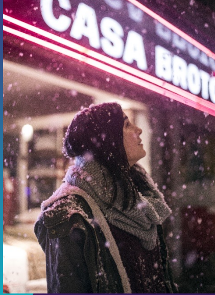
EXPERT MARKETING TEAM