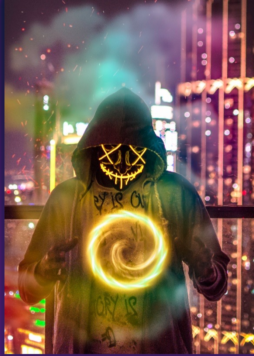
BASED CONTRACT DEVELOPERS