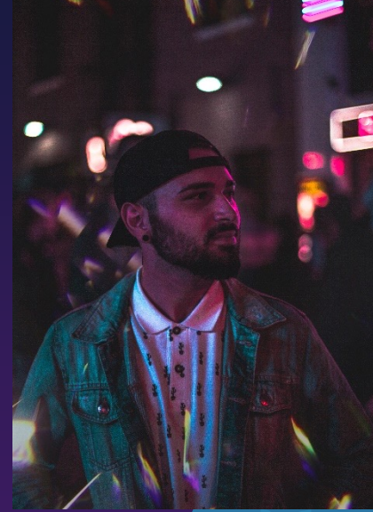
EXPERIENCED BLOCKCHAIN GAME DEVELOPERS